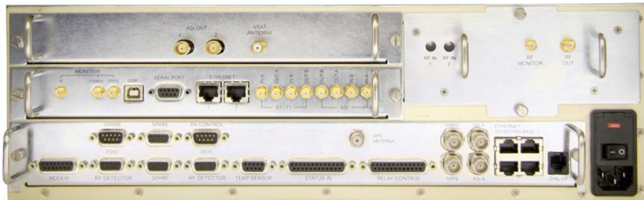
Fig.1 - Rear Panel